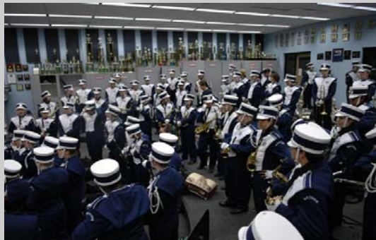
The Marching Cowboys preparing to take the field.

The Gaither High School Marching Band, Wind Ensemble, Concert and Symphonic Bands, Jazz Bands and Starettes perform before thousands of people each year in football games, contests, concerts, and parades as well as being featured by television and newspapers both locally and on a statewide level. This means that our Bands offer a great deal of exposure for our Corporate Sponsors. Not only does sponsorship of the Gaither Band