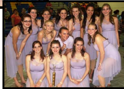
2009 District 1st Place Winners GHS Starette Winter Guard