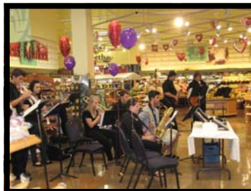
Gaither HS Jazz Band performing for a special function at a local Sweetbay.

Let us perform at your special function!