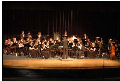
The Wind Ensemble at State MPA